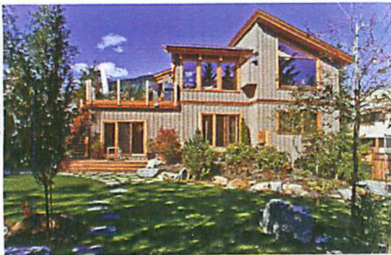
JOEFIN HOMES

Ziptrek Ecotours offers visitors the unique opportunity to soar high over the forest's canopy on ziplines and also explore this magnificent setting on Treerack's network of catwalks and platforms — all while learning about the area's flora and fauna from a knowledgeable guide. But right from its initial construction using eco-friendly methods through to its operations today, the company has always tried to minimize its environmental impact on the pristine forest it showcases. In addition, using a small-turbine, micro-hydroelectric generating unit in the creek below its operation, Ziptrek generates all of the electricity it uses on the mountain without producing a single molecule of carbon dioxide.